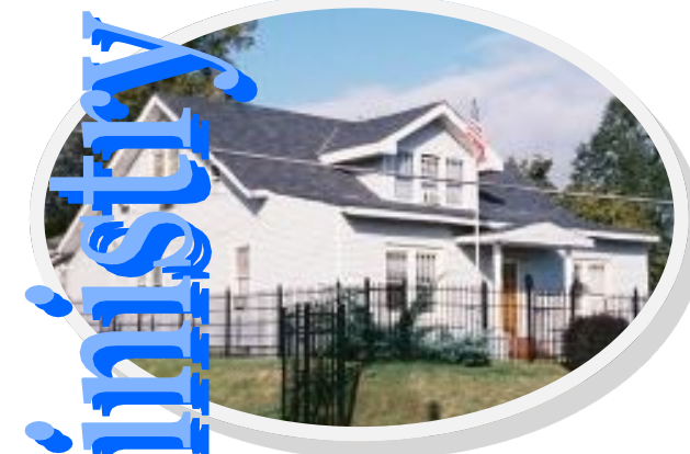
WINGARD HOME/JACKSON CAMPUS

When a person is hungry & you give them a fish, they will eat for one meal: the greatest service to them is to teach them how to fish and where to fish, So they are able to feed themselves & their family for a lifetime!