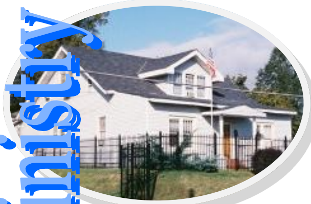
WINGARD HOME/JACKSON CAMPUS

".....enable Your servants to speak your Word with great boldness . Stretch your hand to heal and perform miraculous Signs & Wonders through the name of your Holy servant Jesus....."